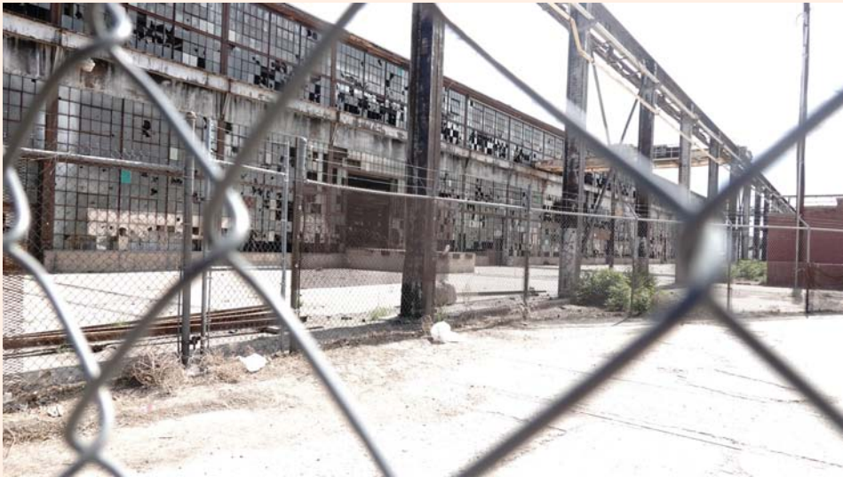
The Wheels Museum is located on the site of the historic Santa Fe Railroad Steam Engine Service Shops. If it has wheels, it is part of this museum