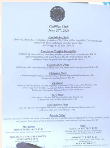
Special CLC Menu just for us