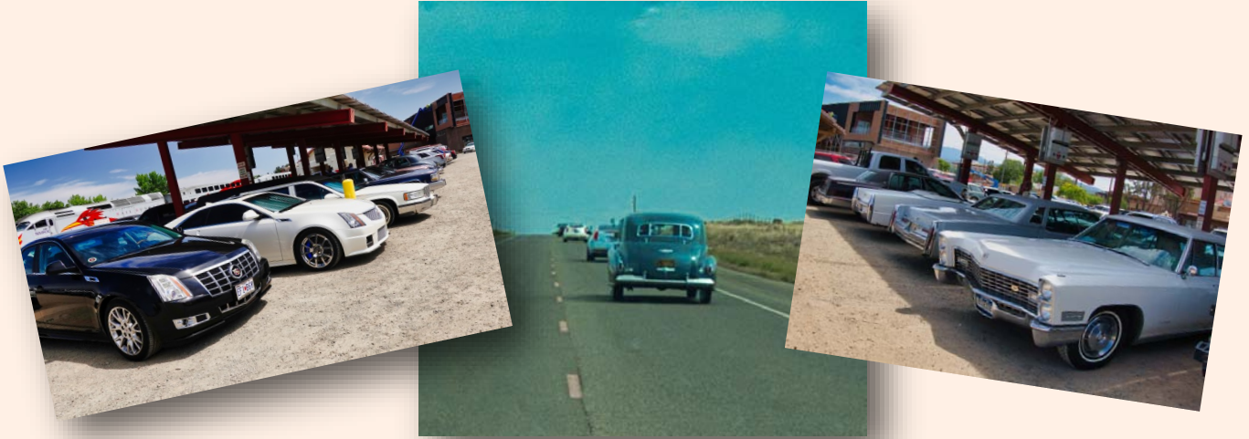
On the Turquoise Trail with 20 plus fine Cadillacs