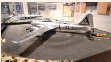
Model of B-29 Enola Gay and Little Boy .