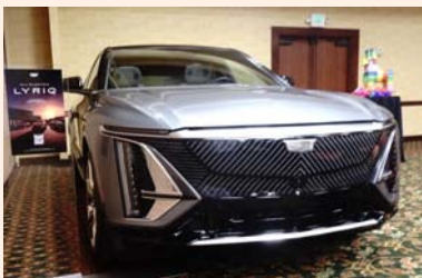
One neat feature of the Grand National, being sponsored by Cadillac, is the preview up close of new models. This is the EV LYRIQ SUV.