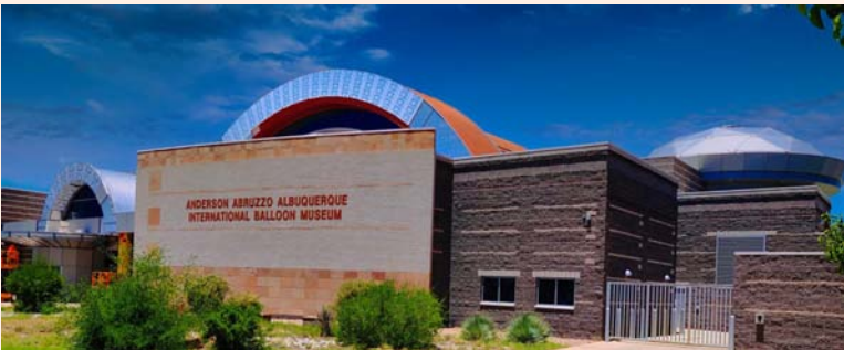
Albuquerque is all about balloons and balloon festivals