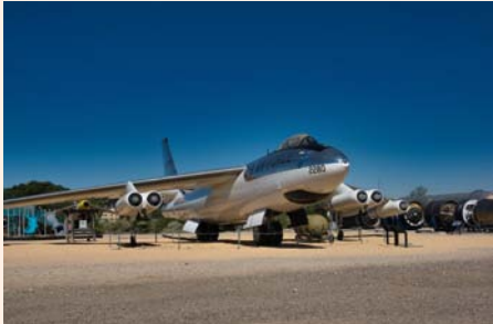
They had many exciting aircraft, missiles, bombs, from many years of nuclear warfare including this rare B-47.