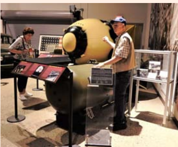
Little Boy, dropped on Hiroshima August 6, 1945